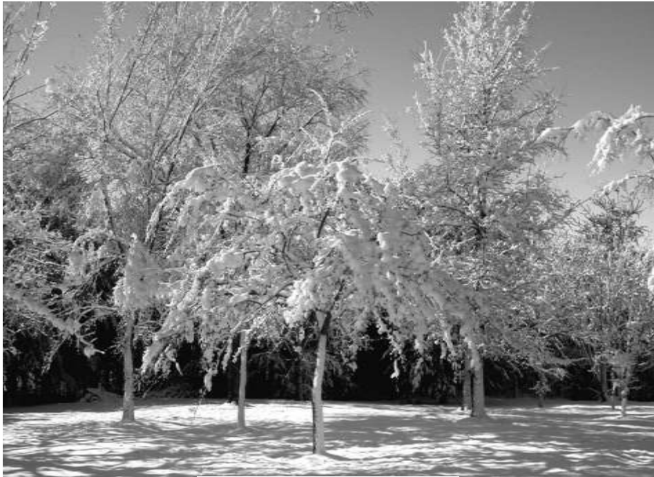
STARHILL FOREST PETERSBURG, IL