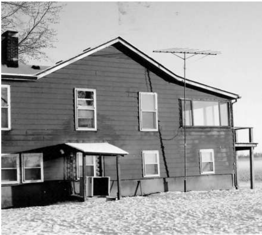
WICKER HOUSE Horseshoe Lake