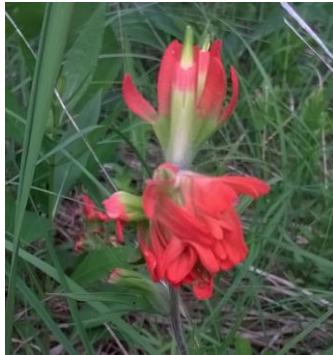
Scarlet Indian Paintbrush

While we didn't see skunk cabbage in January, we did on our trip to Trout Park Nature Preserve in April. Additional field trips included Black Partridge Woods in April, Montrose Beach Dunes (with the great Utricularia find) and Ball Horticultural restoration areas in August. We rounded out the season with a trip to Hidden Fen in Glacial Park . Other noteworthy regional events include the DuPage County Bioblitz (see summary) and the annual INPS gathering at Forest Glen Preserve .