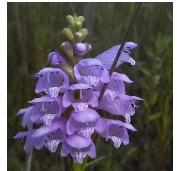
Obedient Plant