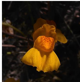
Common Bladderwort

including 6 ferns. The vast majority of the vascular plants observed were native (312 species, 71%). Although the majority of the species documented were vascular plants, none were new to the district. Also found: sixty-four species of lichen, 25 species of mosses and 4 liverworts! A number of these were new to the district. Forty-seven fungi were observed including thirteen species new to the district. This could be interpreted as a reflection of our enthusiasm and dedication to vascular plants. Next time you are out in the woods remember to make note of the ferns, fungi, and non-vascular plants. The list is pretty short. You could learn most of them in a (good) season, and vastly expand our knowledge of the communities you visit! Happy hunting. - Linda