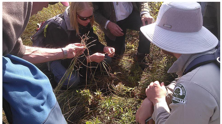
Sedge identification at Hidden Fen.