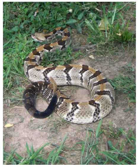
Timber Rattlesnake

Over two memorable years I made 73 seed collections (24 RFSS, 14 RFSS Eastern Region, and 19 associate species) representing 57 different species. Many more species and locations were documented, although seed collection for these was not possible due to circumstances. All collections and finds were reported to the FS, the Seedbank, and, where state listed, to the Illinois Natural Heritage Database.