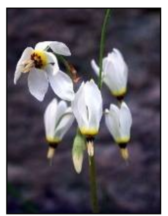
Dodecatheon frenchii – French's Shooting Star