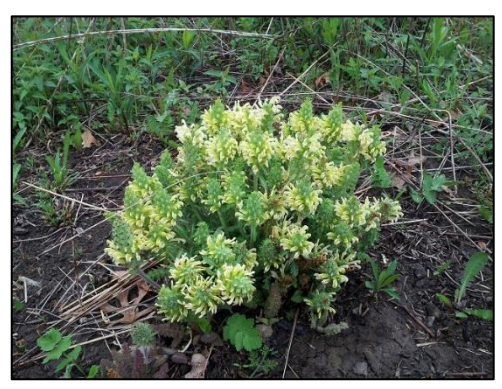
Wood betony, Pedicularis canadensis.

The most important graminoid species are presented in Table 3.