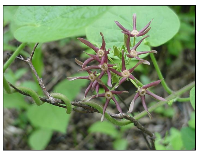
Climbing milkweed, Matelea obliqua.

Soon after, the Shawnee National Forest was cleared to implement management on Barker Bluff RNA. The Forest Service, Lafarge, and the IDNR began to coordinate a joint burn on the entire INAI site. The Barker Bluff Land & Water Reserve and Barker Bluff RNA prescribed burn was on March 16, 2016. The area encompassed 240 acres. Within this burn unit is an Illinois Natural Area Inventory site; 77 acres that includes a high quality, Grade A and B limestone glade community, a Grade B dry upland forest/limestone glade community, and a Grade C dry upland forest. By summertime of that year, glade and barren Indicator species such as wild petunia ( Ruellia humilis ), purple milkweed ( Asclepias purpurascens ), climbing milkweed