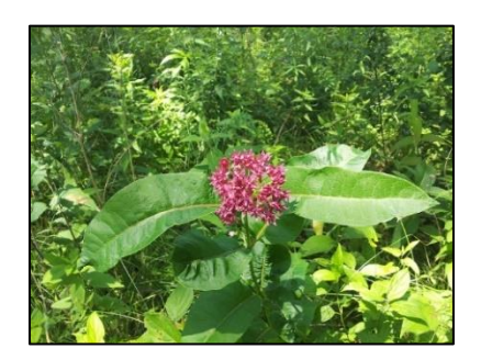
Purple milkweed, Asclepias purpurascens.