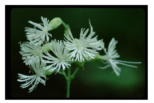
Ovate catchfly, Silene ovata .

At first glance, Barker Bluff RNA seemed to be degraded and overgrown because the site is shifting to a more shade-tolerant plant community. It is well documented that due to dry soil conditions and occasional fire, the woodlands and glades were much more open in early settlement, and sun-loving grasses and wildflowers were able to thrive. Naturally occurring fires were soon suppressed after the area was settled, and fire-intolerant species (many of which are shade-producing trees) increased. The limestone glades and open dry upland forests were soon grown up in woody shrubs and vines and more shade-tolerant forest species, due to the change in available light. Many of the sun-loving plant species that once thrived in open woods and glade openings were non-flowering and spindly because of the shady conditions and tangled catbriers and other vines.