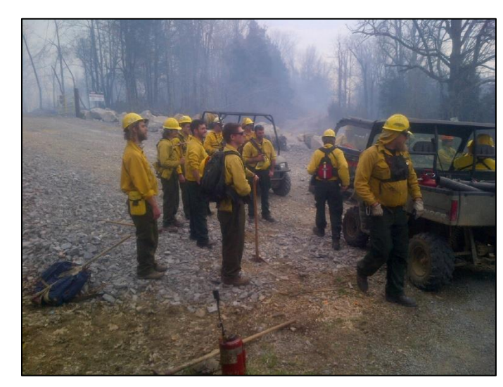
Fire crew.

On April 1, 2014, the first ever recorded prescribed fire was conducted at Barker Bluff on 150 acres owned by Lafarge. The burn was by a 23-person crew consisting of the IDNR, Southern Illinois University Fire Dawgs, Southeast Illinois Prescribed Fire Association, The Nature Conservancy, and contractors from the Shawnee Resource and Development Area. A few months after the burn, we found hundreds of ovate catchfly plants where the first five were discovered. They were all on the burned area; none was on the unburned Forest Service portion. Once again the plants were flowering! Also to our joy, the State threatened climbing milkweed ( Matelea obliqua ) was seen blooming on the fire-line and later set seed. A welcome sight indeed.