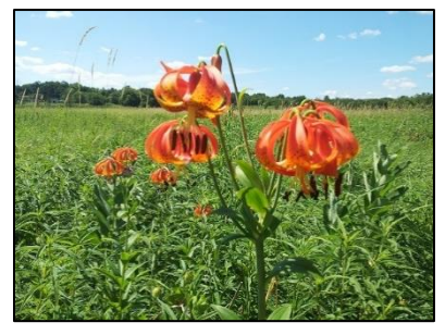
Michigan lily, Lilium michiganense.