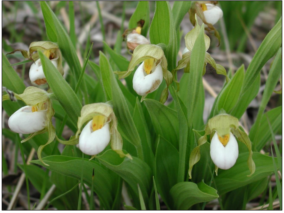
Small white lady-slipper orchid, Cypripedium candidum.

"...dedicated to the study, appreciation, and conservation of the native flora and natural communities of Illinois."