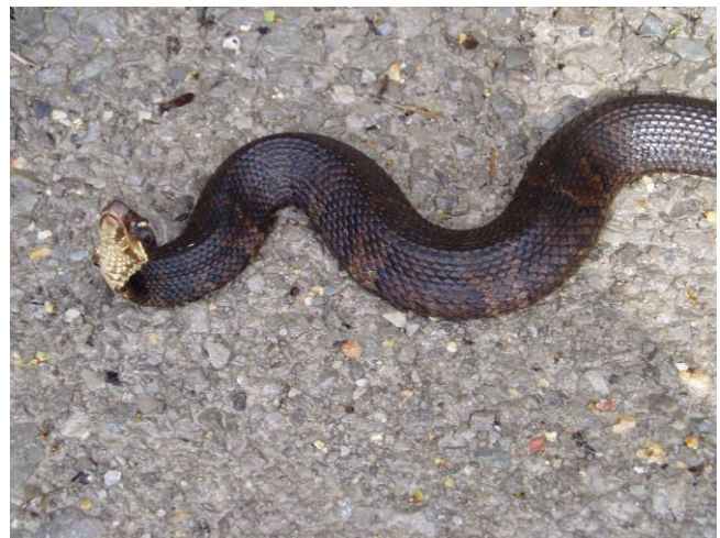
Agkistrodon piscivorus - Cottonmouth