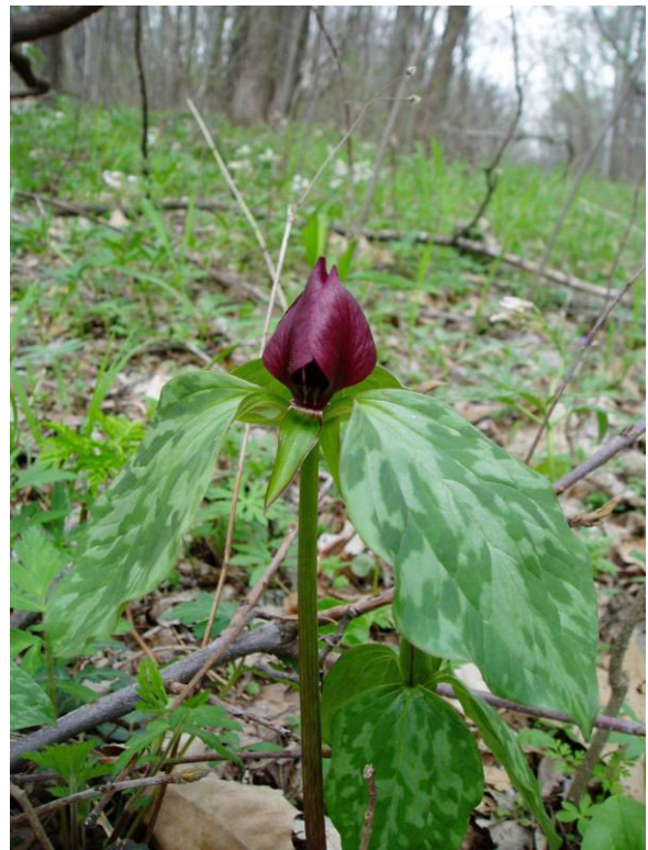
Trillium recurvatum – Purple Trillium

To get there: From Highway 3 south, take the 2 nd left after crossing the Big Muddy River (LaRue Road, look for sign) and take a left at the base of the bluff to parking area at the SOUTH end of the snake road.