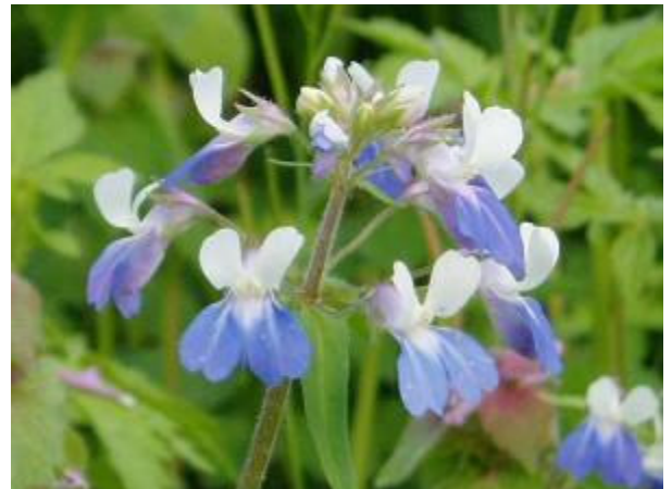
Collinsia verna – Blue-eyed Mary