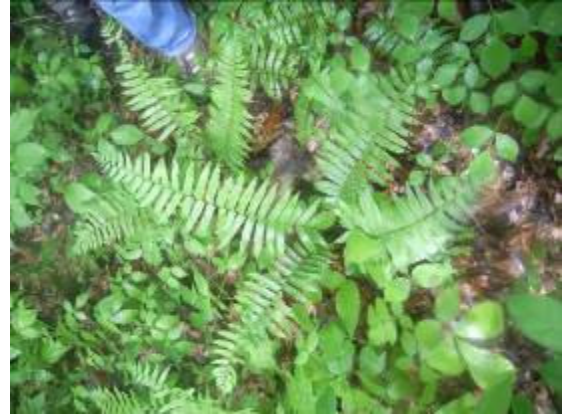
Glade Fern – Diplazium pycnocarpon

Last weekend was our spring social at the Ozark Hills Nature Preserve in the Trail of Tears State Forest and it was a great time! After a fine lunch, we formed teams and set out to find the 50 species of trees, forbs, and ferns along the trail that were listed on the plant scavenger hunt. Despite light rain for a few minutes in the beginning, everyone really enjoyed this activity. There were many neat ferns such as Grape Fern ( Botrychium virginianum ), Glade Fern ( Diplazium pycnocarpon ), and Silvery Spleenwort ( Deparia acrostichoides ) as well other species in bloom