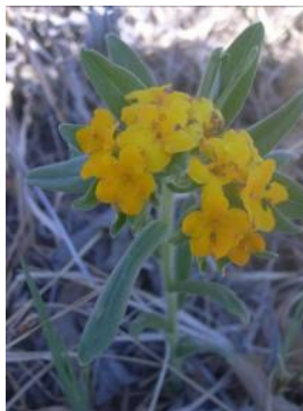
Lithospermum canescens – Hoary Puccoon

Next Month: No regular monthly meeting Get outside to one of our many events!