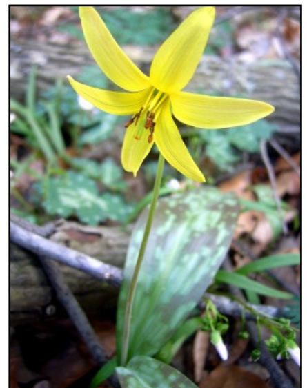
Erythronium americanum – Trout Lily