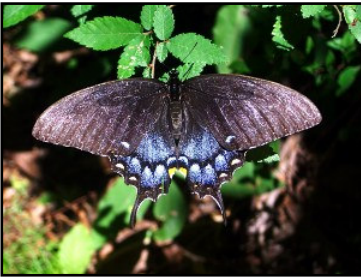
Battus philenor - Pipevine Swallowtail