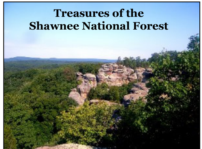
Treasures of the Shawnee National Forest