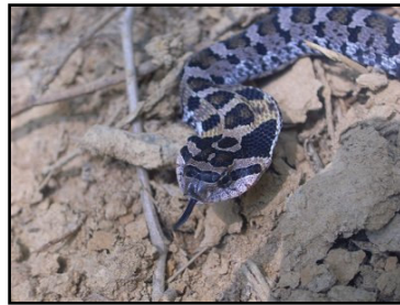
Heterodon platirhinos - Hognose Snake