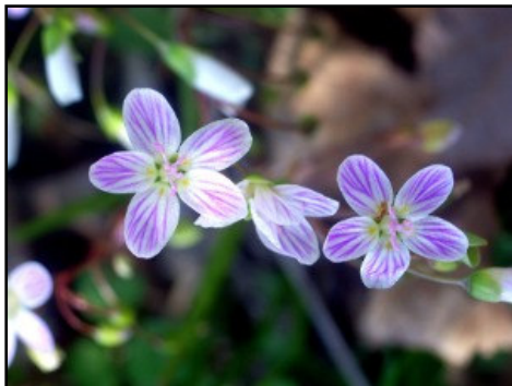
Claytonia virginiana – Spring Beauty

The winter tree ID walk for last month was cancelled due to the unpleasant weather conditions. We hope to try again next year.