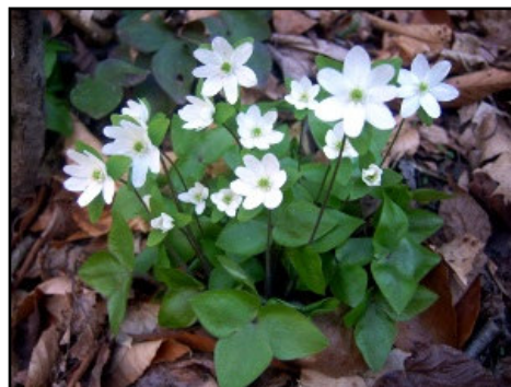
Hepatica acutiloba – Liverleaf