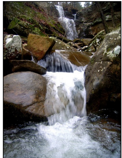
Burden Falls Wilderness