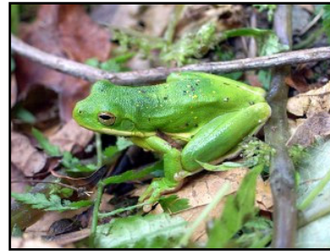
Hyla cinerea - Green Frog