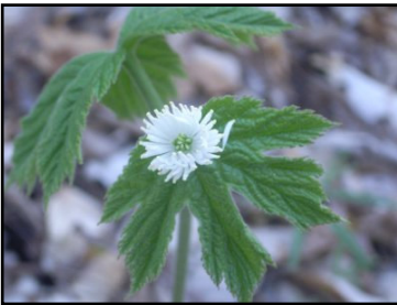
Hydrastis canadensis - Goldenseal