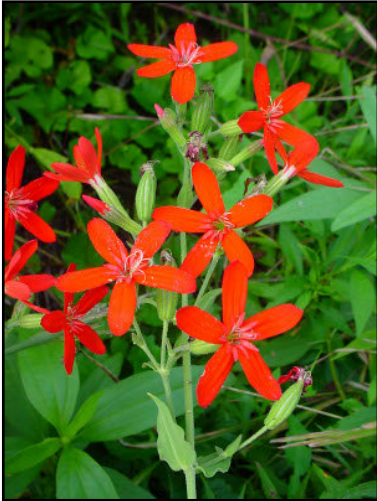
Silene regia – Royal Catchfly