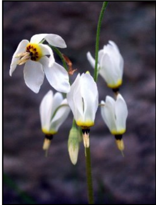
Dodecatheon frenchii – French's Shooting Star

southernillinoisplants@gmail.com www.ill-inps.org