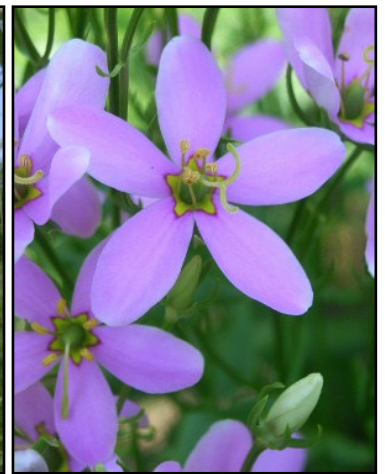
Sabatia angularis Rose Gentian