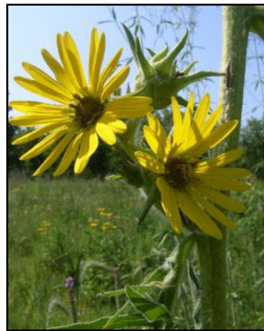
Silphium laciniatum Compass Plant