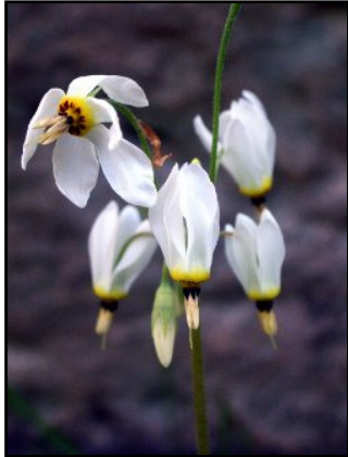
Dodecatheon frenchii – French’s Shooting Star

southernillinoisplants@gmail.com www.ill-inps.org