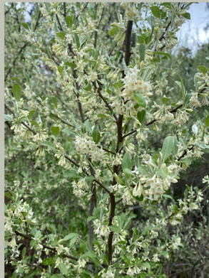
Autumn Olive Elaeagnus umbellata

Autumn Olive is an invasive bush growing in Southern Illinois. Invaded areas include open fields, wood edges and forest openings. Fruits are spread by birds.