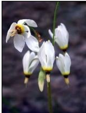
Dodecatheon frenchii – French's Shooting Star

southernillinoisplants@gmail.com www.ill-inps.org