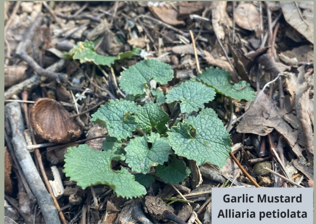
Garlic Mustard Alliaria petiolata

Garlic mustard is an invasive biennial herb growing in Southern Illinois. First year, basal plants are visible in the winter and spring.